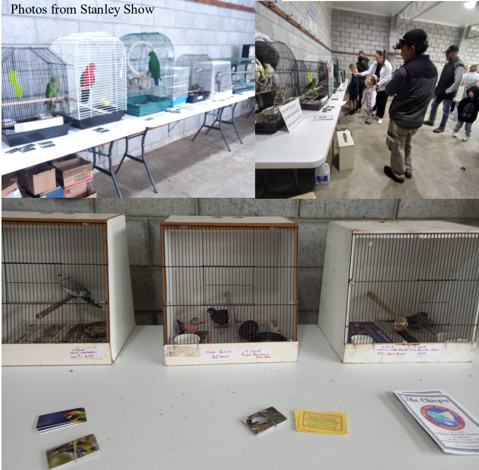
Photos from Stanley Show